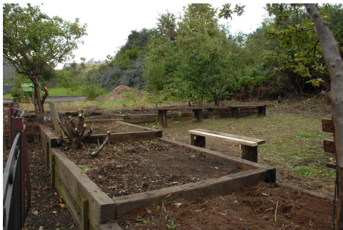
Work complete - how the renovated site looked at the end of a hard days work

It was a spot for fly-tipping and discarded household waste and the youngsters in the school playground look straight on to it.