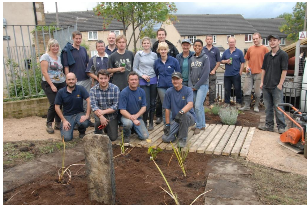
With work completed, the team celebrate a great day of community action that has seen the complete revitalisation of an important green-space in the Heeley area