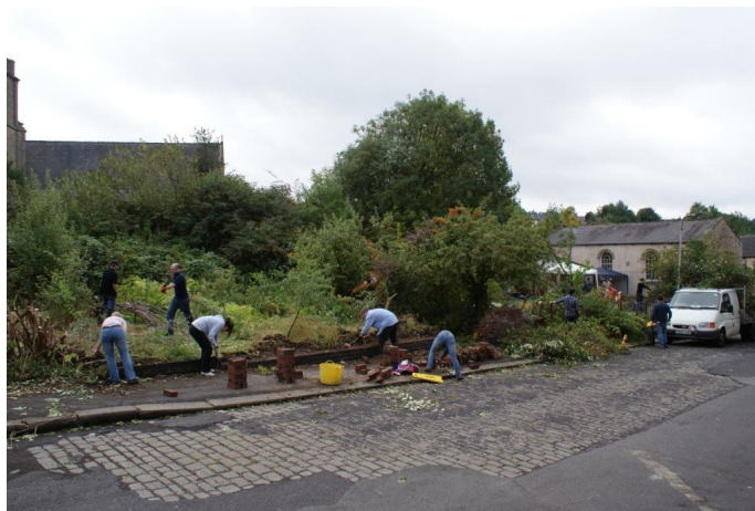
How the site looked in the early stages of the clean up operation

"Hopefully people in the area will see it being maintained and used and commit to keeping it like that.